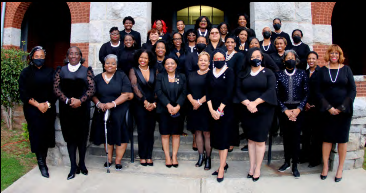
For more details, visit: WABE News

When women lead, communities can thrive.