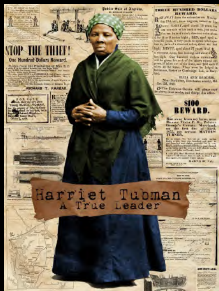
Pictured above: Harriet Tubman - African American Abolitionist