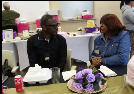
Pictured Above: Images are from the Annual Law Enforcement Luncheon (2025, Clayton County Police Department Headquarters, Jonesboro, Georgia).

“WHEN PEOPLE VALUE WHERE THEY LIVE, THE ENTIRE COMMUNITY BECOMES STRONGER.”