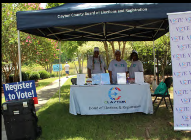
Pictured: Clayton County Board of Elections employees encouraged VLR residents to vote at the 2024 4 th of July Celebration.

“WOMEN KNOW HOW TO REACH PEOPLE. THEY KNOW WHAT TO SAY AND HOW TO BRING A COMMUNITY TOGETHER.”